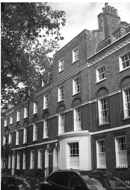
36 West Square, close to Elephant and Castle, the building that housed the Admiralty's semaphore telegraph station on the route to Deal

A British naval officer, investigating after the battle of Waterloo, found it was possible to send a message from Paris to Strasbourg in fifteen minutes. Those cities are 400km apart, so that means the signal travelled at an average speed of 1,600km/h – a lot faster than a dispatch rider on a horse. It's also, incidentally, faster than the speed of sound, which is about 1,200km/h.