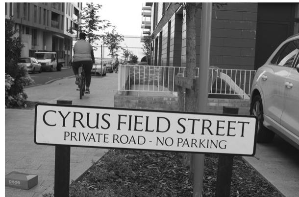
Cyrus Field Street, Greenwich, named after the main financier behind the original Atlantic cables, after a suggestion from the Enderby Group

In 1853 the Wharf Road gutta percha factory burned down. Though it was rebuilt on the same site, in 1854 much of the operation moved to Morden Wharf in Greenwich. One of the Gutta Percha Company's neighbours on the west side of the Greenwich Peninsula was another cable maker, W T Henley, which later moved to North Woolwich, where there is still a Henley Road, surrounded by dereliction. A series of mergers saw the creation of Glass Elliot in Greenwich, at Enderby House, alongside the Gutta Percha company in Morden Wharf. The house is named after the Enderby family, who were whalers: there is an Enderby Land in Antarctica.