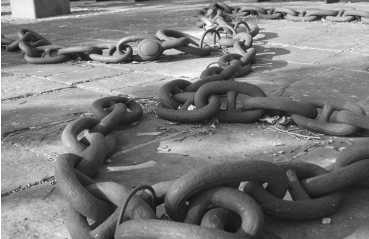
Launch site of the Great Eastern on the Isle of Dogs: designed as a passenger liner, Brunel's ship was used for the first two successful Atlantic cables in 1866 and the first Britain-India cable in 1870

26,000km, of cables that were used in the North Sea, the English Channel, the Aegean, the Mediterranean, the Gulf, and the Bay of Bengal.