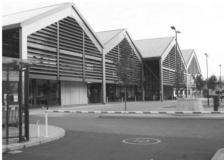
Alcatel Submarine Cables, Greenwich, on the site of the 1850s Telcon cable factory. Nokia, the owner, plans to sell it to the French state