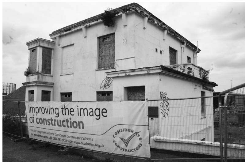
Enderby House, formerly the headquarters of Telcon and subsequently of STC's submarine cable business, derelict and unprotected in 2014

Let us compare and contrast the world before telecommunications and the world after 1851, when the first subsea cable across the English Channel went into service, linking the British telegraph networks, already extensive, with the emerging networks in mainland Europe and beyond. Let's start at the beginning, with the correspondence between Pliny the Younger and Trajan, the Roman Emperor. Pliny (or Plinius in Latin) was Trajan's governor of Bithynia and Pontus, now in modern Turkey, 1,600km from Rome as the crow flies. But the crow didn't fly: Pliny's letters – many of which are still in existence – had to go by sea via the Black Sea, the