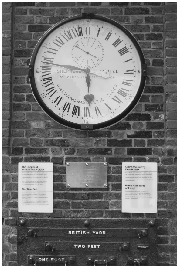
Clock at Greenwich Observatory, which provided the first national time signals via telegraph lines

company's first project was to connect London with Birmingham, Manchester and Liverpool. Mostly their wires were suspended from poles but sometimes they needed insulation. Tar, wax and pitch didn't work, and Michael Faraday suggested gutta percha. The first person to actually use gutta percha seems to have been Werner von Siemens, one of the formidable trio of Siemens brothers. One of his brothers, Wilhelm, or William, and later Sir William, came to London to set up a factory for the company in Charlton. Another brother, Karl Heinrich, set up the Russian operation in St Petersburg. Their Charlton factory, though they called it Woolwich, was just to the west of Woolwich Dockyard. The oldest buildings date to 1863, and development continued until the 1950s